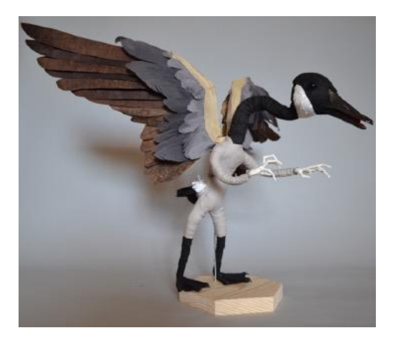
Corrie Steckelberg, Goose, textile, 2018