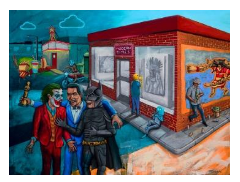
Jonathan Thunder, Modern Times, acrylic on canvas, 2020