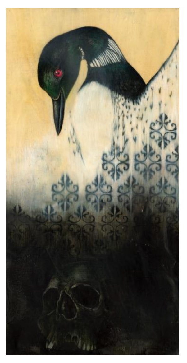
Naomi Hart, Requiem, encaustic mixed media, 2018