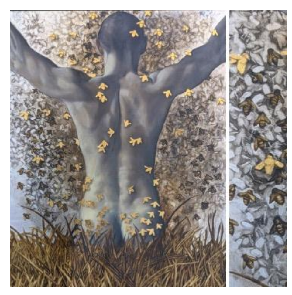
Tara Stone, Drone , oil paint, metal leaf, 2016