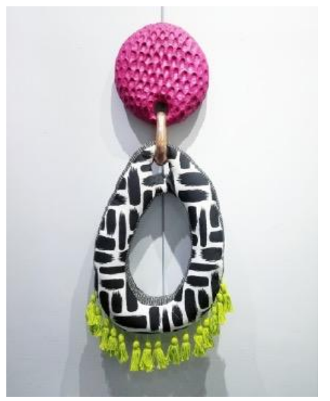
Allison Baker, Earing, Fabric 2020