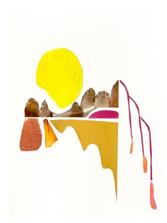
Cassandra Quinn, No. 34, mixed media collage 2021