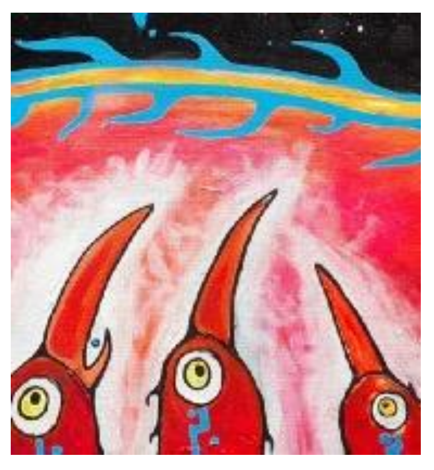
ChimakwaNibawii Stone, Mother TBird (detail), acrylic 2020