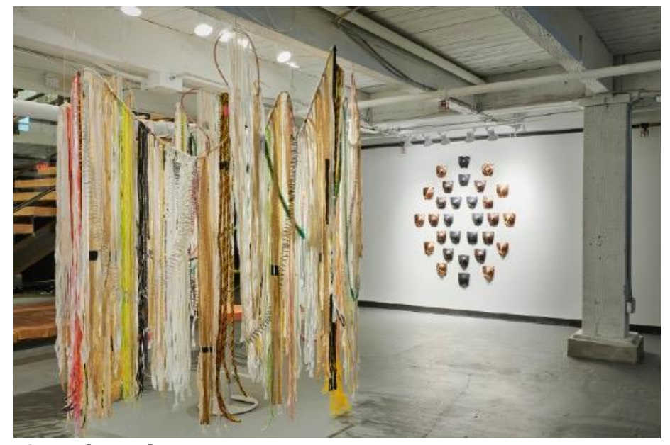
Tia Keobounpheng Veiled Bloodline, mixed media 2020 FORCED/FORCE copper, 2020